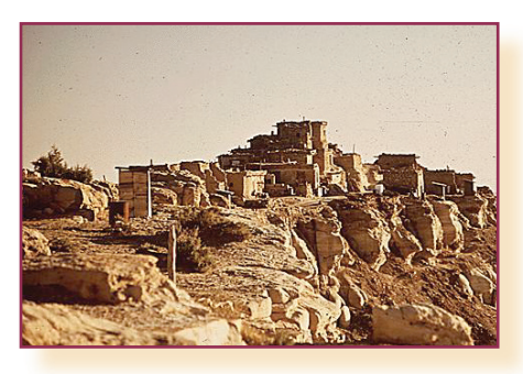
Ancient Hopi pueblo