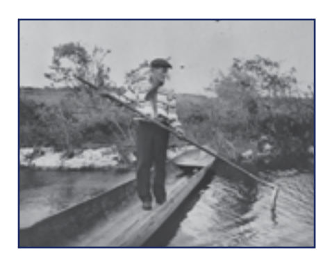
A Seminole fisherman

The Seminole tribe of Native Americans began when members of the Creek tribe moved to Florida in the 1700s and united with other tribes. Their language is similar to the Creek language.