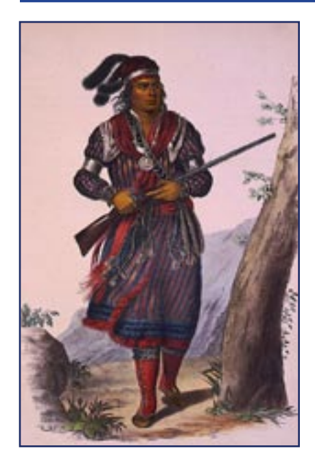
A Seminole man wearing traditional clothes about 1842.