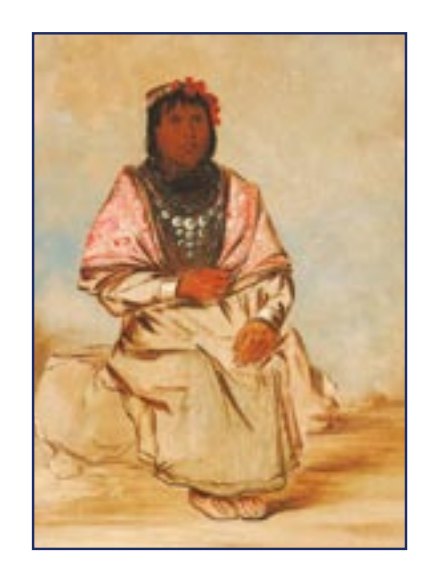
A Seminole woman in traditional clothes about 1838

The Seminoles in Florida lived in houses called chickees. A chickee has no walls and has a thatched roof, or a roof made of woven palm branches.